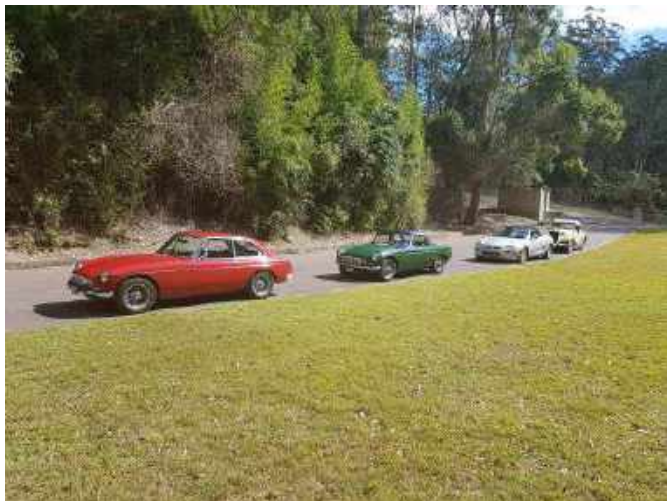
A row of the participating club cars at Chichester Dam

Peaceful serenity of a babbling brook at Chichester Dam area where we stopped for a picnic lunch.