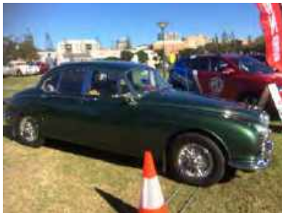
Host club cars on display