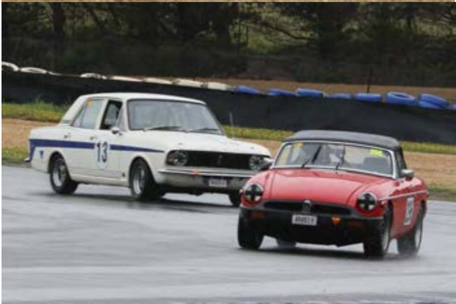
Top Photo Matt leading an MG Midget during the racing. Lower photo Gary leading a 1969 Cortina during Regularity Racing