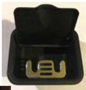
Inside new crackle paint no springs