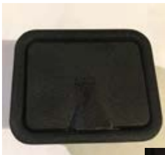
New crackle paint