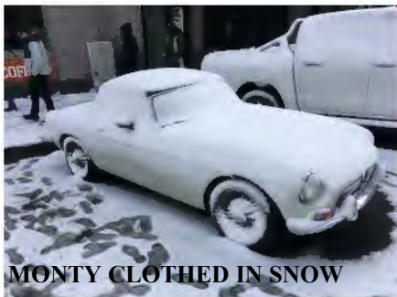
MONTY CLOTHED IN SNOW

(yes Monty) slowly disappear under a blanket of white. A few times we glanced out the pub window and the snow seemed to be coming