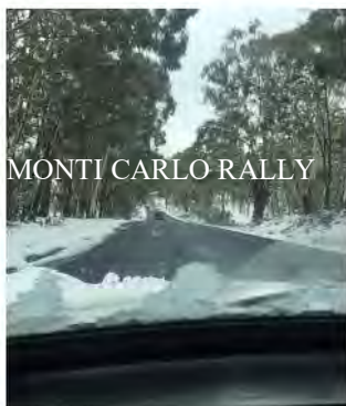
MONTI CARLO RALLY

Hmmm) we consulted with the constabulary as to the best way out. East was out, South and North were closed. Only mad people would go west. We are driving an MG and Minis in snow so we qualify totally as insane. We back tracked towards Tarana and after several K's following 3 Minis through snow covered countryside looking like a picture from the 1965 Monti Carlo Rally, we emerged to a clear sky and roads.