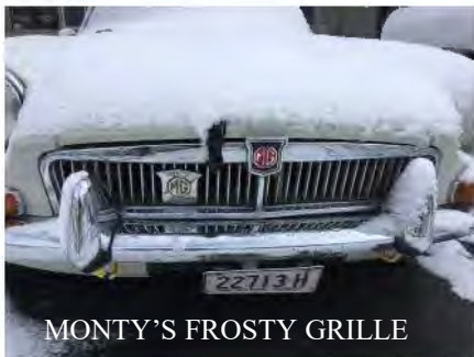
MONTY'S FROSTY GRILLE