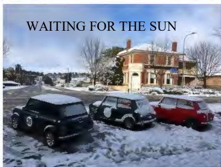
WAITING FOR THE SUN