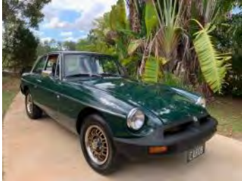
For Sale Photograph

It will not be long hopefully before I will become his navigator on clubman runs.