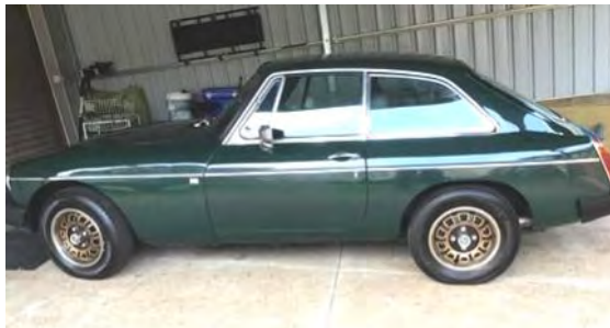
Safely parked in it's new home

No damage to his trailered car nor to the borrowed trailer