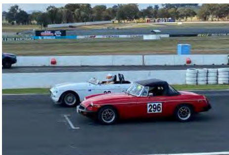
Gary Piper at start line at Winton