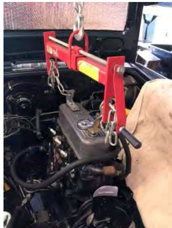
Makeshift lifting brackets attached and balancing bar ready for removal of engine