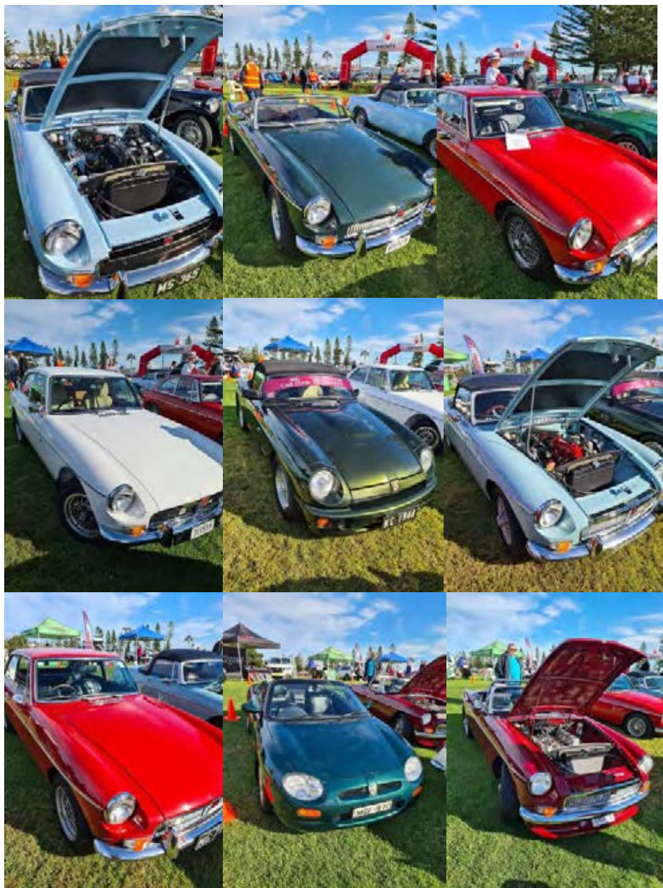
MG Car Club Hunter Region Members cars at Euro Motorfest 2022