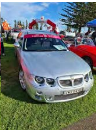
Photographer's pride and joy Rover MG ZT