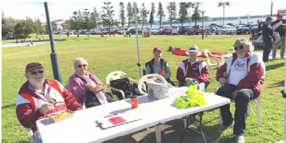
A well earned coffee break for some club volunteer workers.