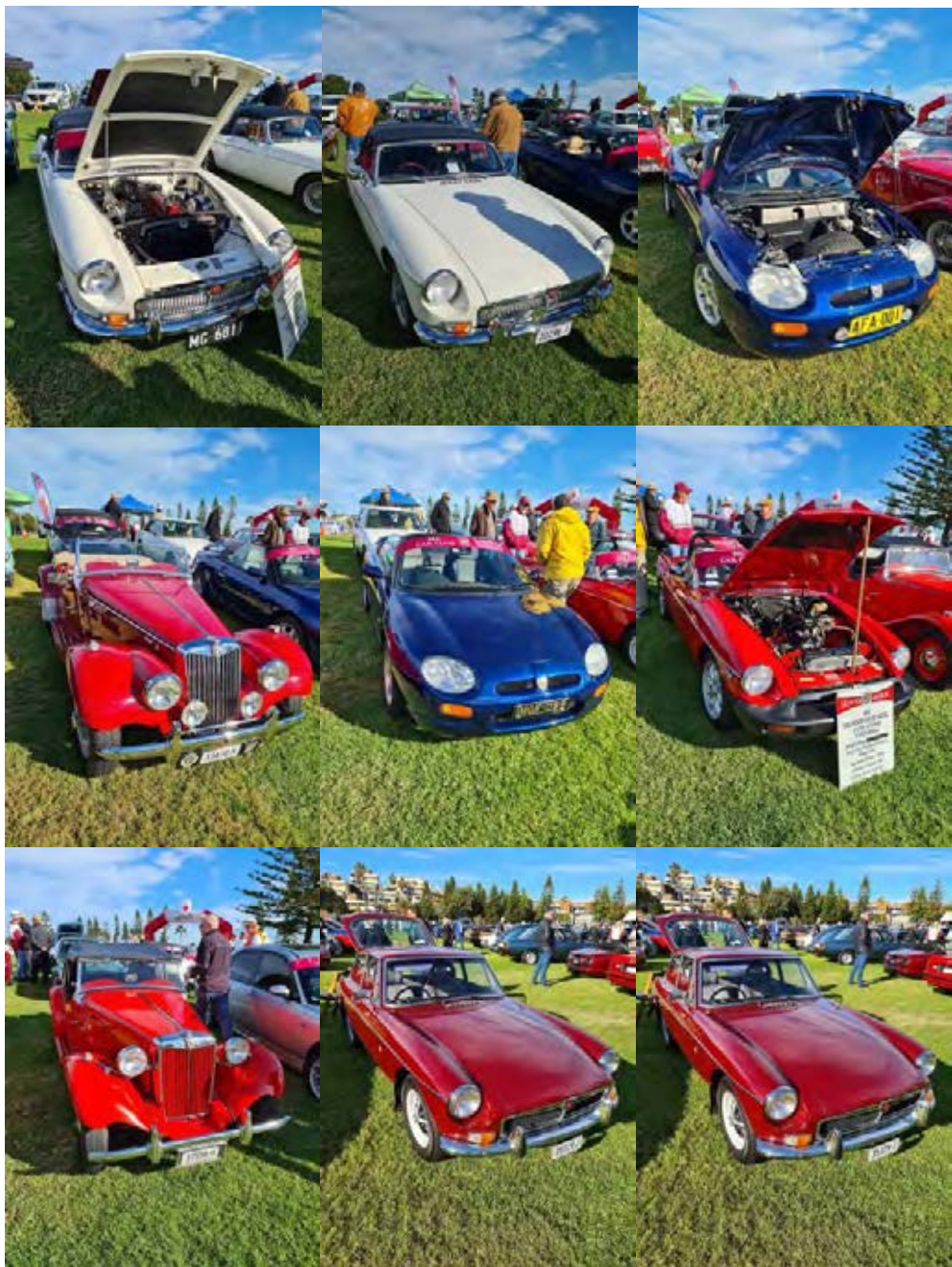
MG Car Club Hunter Region Members cars at Euro Motorfest 2022