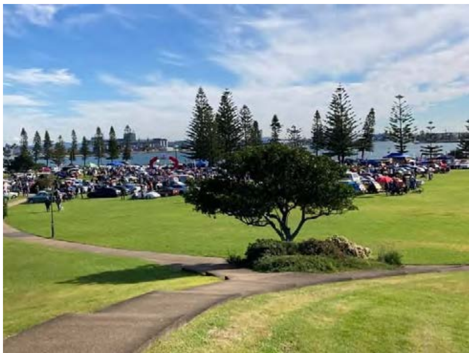
Overall view of car display with small tree blocking