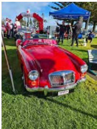
The CLASSIC Pidgeon Pair ?