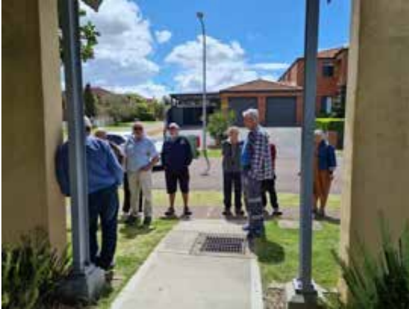
Entrance to facility