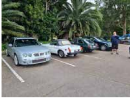
Start point at Maccas car park Hexham.

The first stop for the tuning run was the Men's Shed at Redhead, in the old colliery buildings.