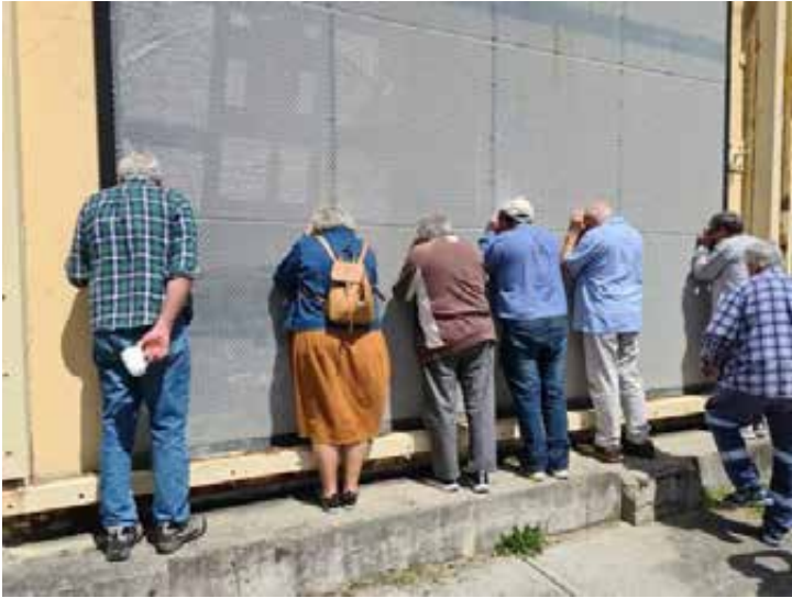
Looking down into casing lined pit shaft