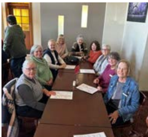
Enthusiastic female members reviewing the lunch menu prior to ordering.

It was a perfect day to bring out the MG's for some exercise