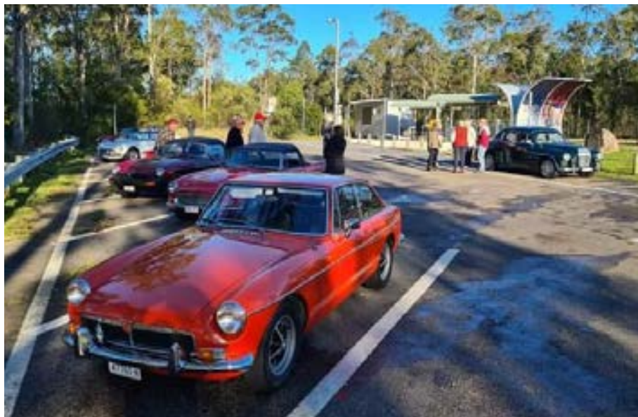
Meeting at rest stop on main highway to travel as a convoy to Booral.