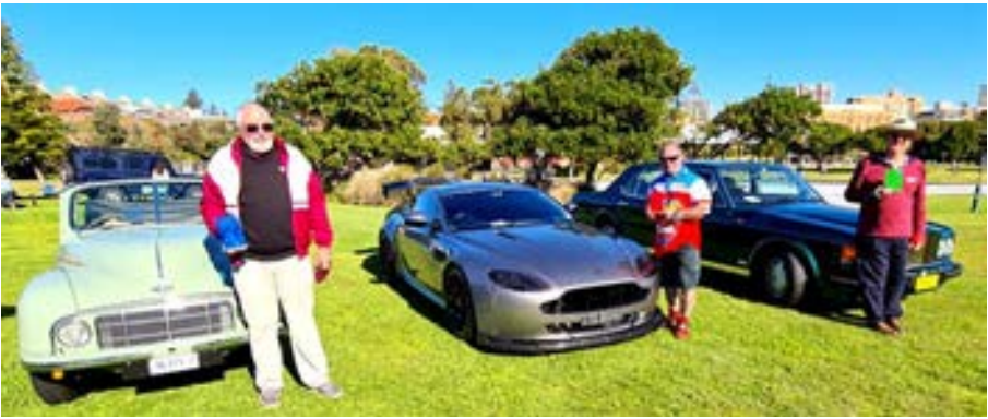
People's Choice winners and their owners

Other upcoming events include “Christmas in July Run” on Sun 16 July, a “Movie Night” on Fri 4 August, our “Club MG Centenary Run & Lunch” on Sat 16 Sept, and our “Annual Concours” on Sat 21 October.