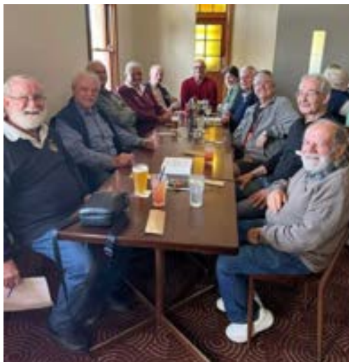
Equally enthusiastic male members wetting their throats and also reviewing the menu