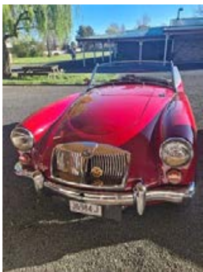
Glen Innes at -1C !!!