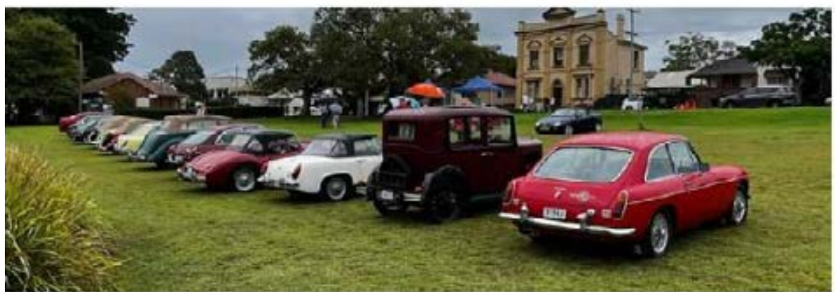
PREVIOUS CONCOURS WINNERS