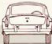
Renovo Soft Top Care Products