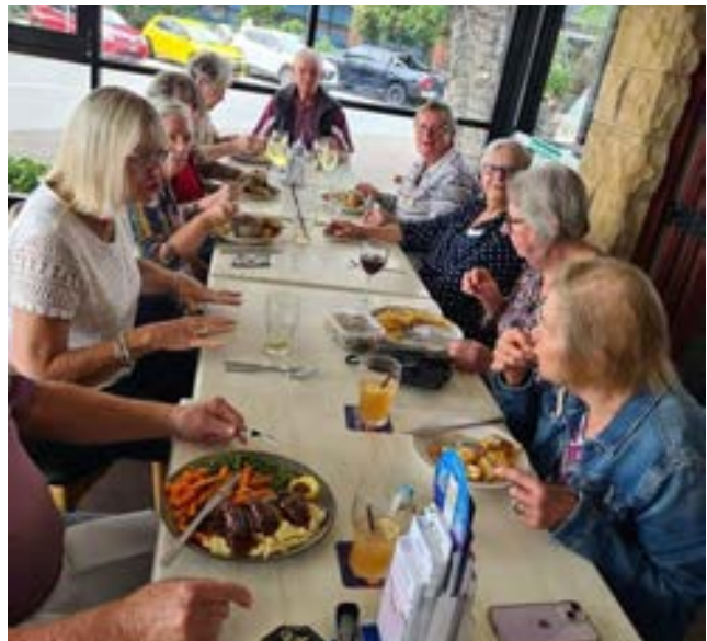
Female patrons enjoying the occasion.