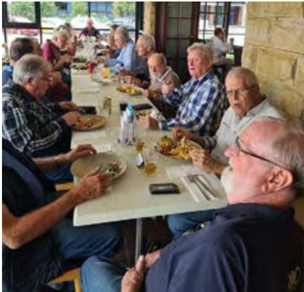
Most male patrons enjoying their meals