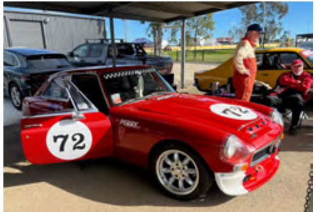
MGCGT entered into Supersprint class