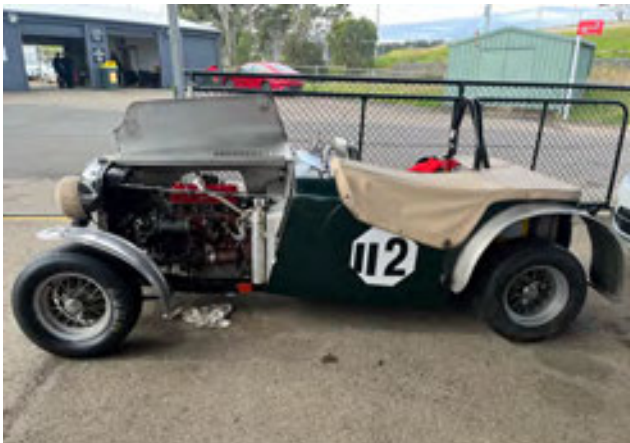
MGTC Entered into Regularity class failed to finish