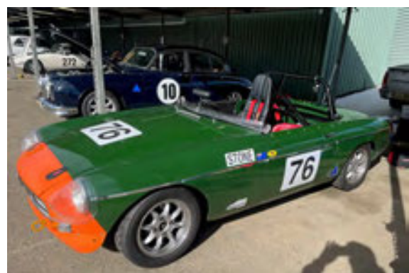
MGB on right of above group