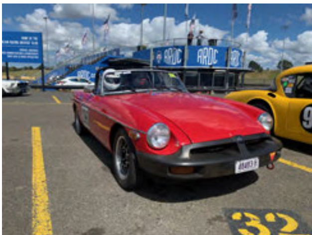
Gary Piper MGB RB at SMSP