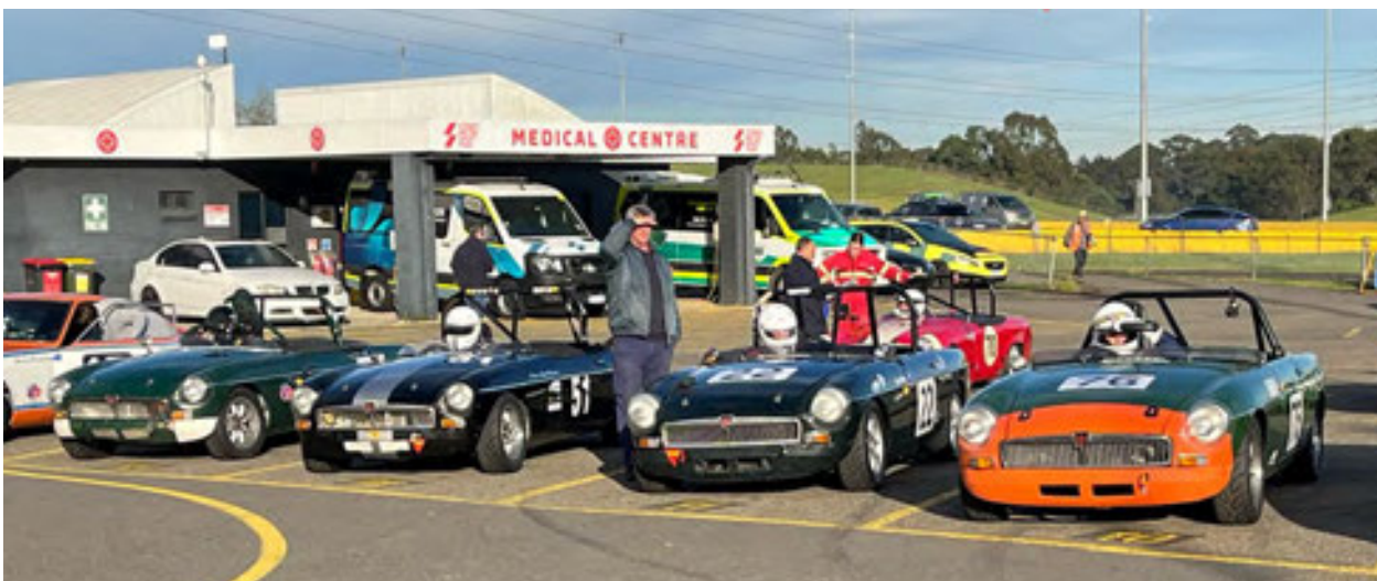
4 MGB's entered into Group S