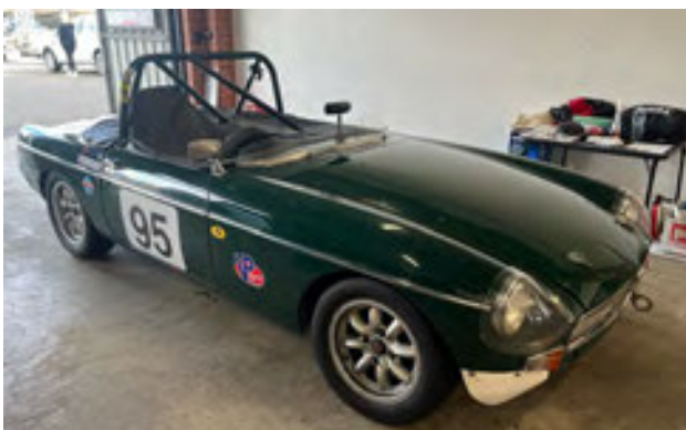
MGB on left of above group