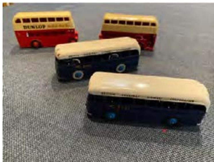
The BOAC Coach in blue and white had transfers along the roof line "BRITISH OVERSEAS AIRWAYS CORPORATION" with B.O.A.C and the flying logo in the mid section