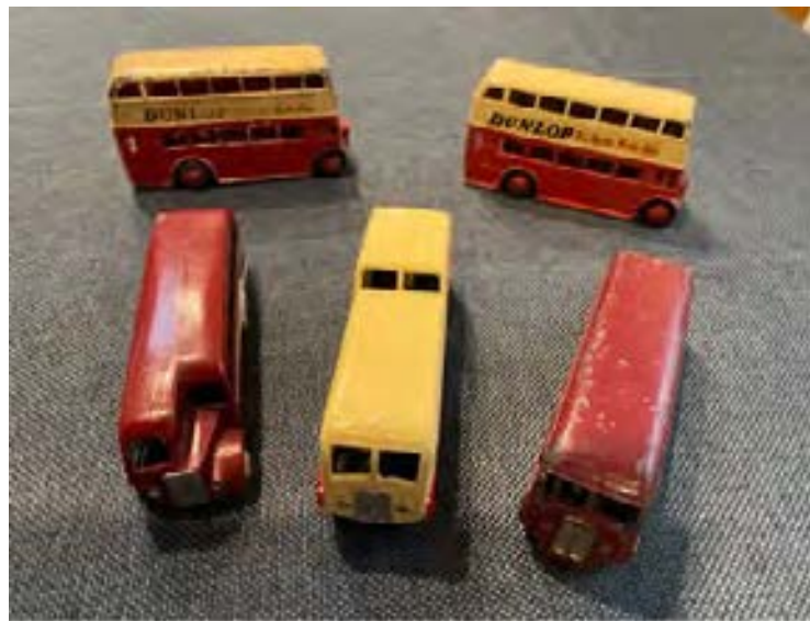
Single Deck Bus, Observation Coach and Luxury Coach in foreground. Note the different radiator grills.