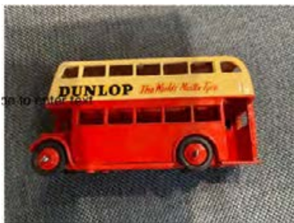
290 Double Decker Bus

It is the second most popular Dinky Toy ever made according to one of my references, being in production from 1938 to 1963 (21 years), with the longest production going to the small trailer, part of the Farm Set at 24 years.