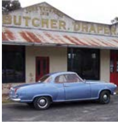
The presenter's Borgward Isabella Coupe

Following are a few pictures of the attentive group of members.