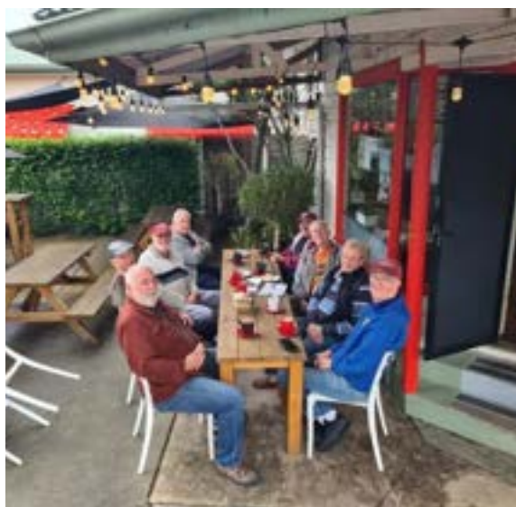
The group whom enjoyed chatting

permission to take photographs of our MG's to use in advertising the events especially that lovely little Blue arrival. We all agreed and gave her permission to use photographs of our cars. Also with her assistance we added a nice red rubber nose roadster to the front of her shop to showcase an early 1934 MG behind a later MGB rubber bumper.